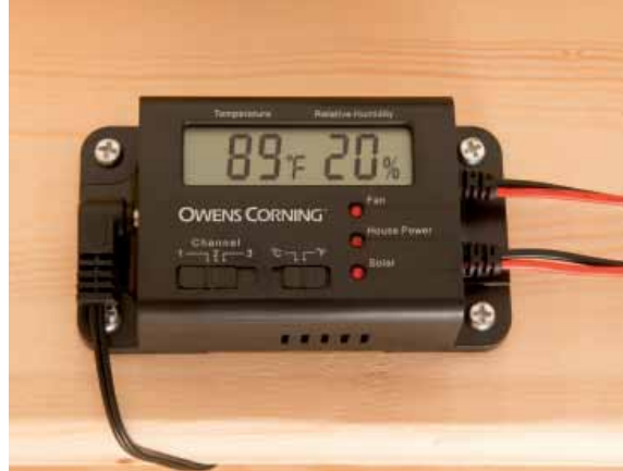
Attic-Mounted Controller Module