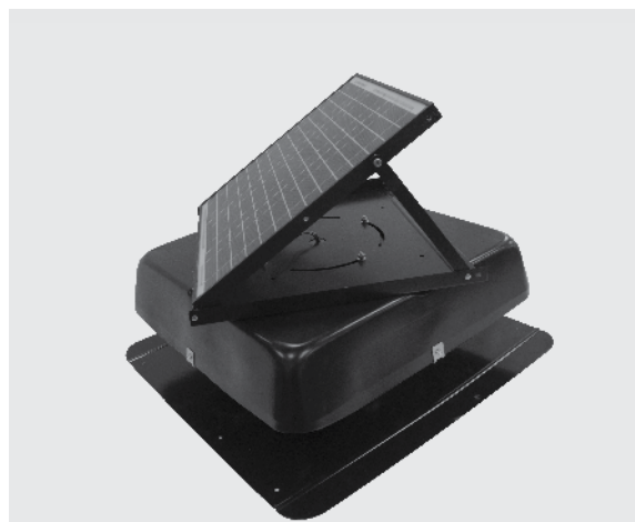
3-Position Panel with Swivel Design