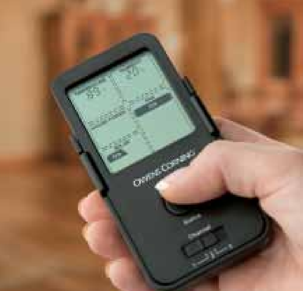
Optional Remote Attic Monitor